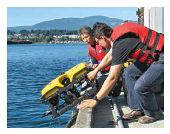
The Seamor ROV © 2016 maxon motor ag